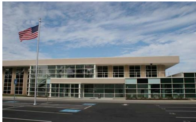
The ASHRAE Headquarters Building in Atlanta, Georgia.

Further information about the ASHRAE Headquarters Renewal is available at http://images.ashrae.biz/renovation