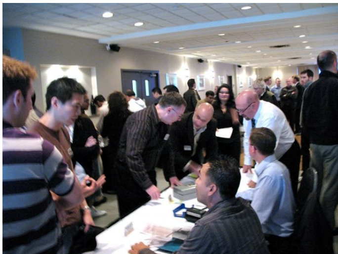
The Registration Desk and the ASHRAE Research Draw Ticket sellers have never been so busy!