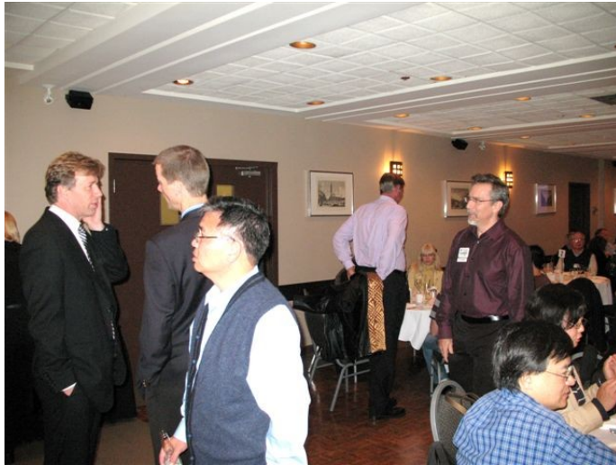
Several BOG members looking bemused wondering if they are going to get dinner!