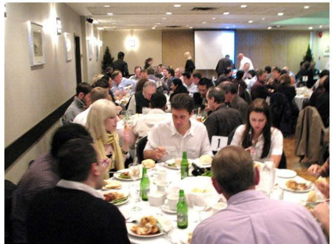
The record breaking numbers at the meeting meant space was at a premium!